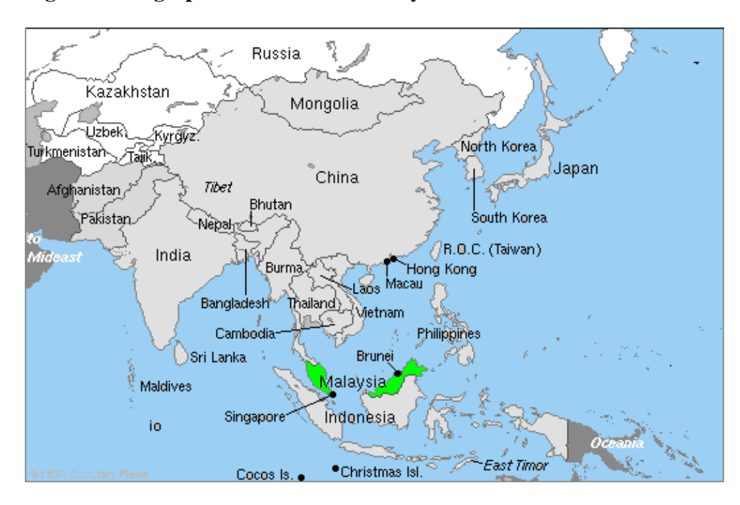
Figure 1. Geographical Location of Malaysia

One reason for great variety of ethnic, religious and linguistic groups in Malaysia can be traced to its geographical location. The region that is now Malaysia comprises Peninsular Malaysia, a peninsula jutting out from the Asian continent and East Malaysia, comprising Sabah and Sarawak, two regions in the island of Borneo (see Figure 1). Peninsular Malaysia lies at the crossroads of maritime trade between the West (India, Arabia) and the East (China). The seas between North Borneo (now Sabah) and the Sulu islands have been an important trading route between Australia and China. There have thus been far-reaching movements of peoples between the West and the East and within Southeast Asia itself (Andaya and Andaya, 1982).